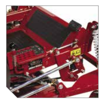
Foot-activated hydraulic deck lift makes raising and lowering the deck effortless.