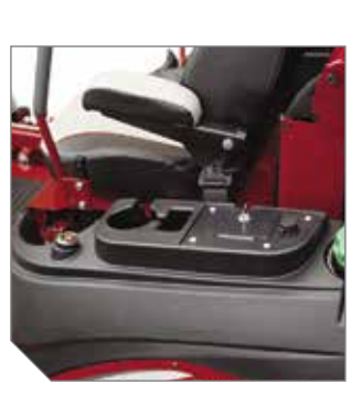
Operator compartment includes ergonomic control panels, a cup holder, mobile phone pocket, 12-volt outlet and storage compartment.