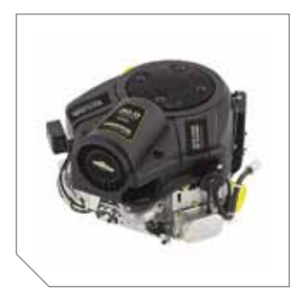
Briggs & Stratton® Commercial Series Engines are built with the ultimate in dust and particle filtration, an advanced debris management system and beefed-up cylinder block structure.