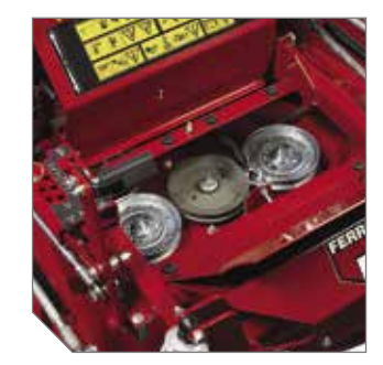
Quick removal of the floor pan provides convenient access to the top of the deck for easy cleaning and service.