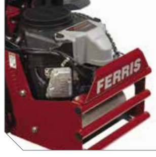
Heavy-duty bumper protects the engine while also allowing for easy service access.