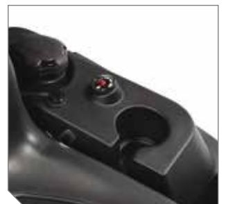
Ergonomic control panel features cup holder and fuel gauge for operator convenience.

Collection systems, mulch kit, trailer hitch kit, ROPS mounted LED light kit, premium seat, flat-free caster tyres