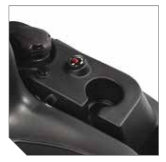
Ergonomic control panel features cup holder and fuel gauge for operator convenience.