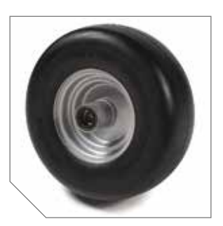
Flat-Free Caster Tyres Run all day with no flats. Standard on select models.