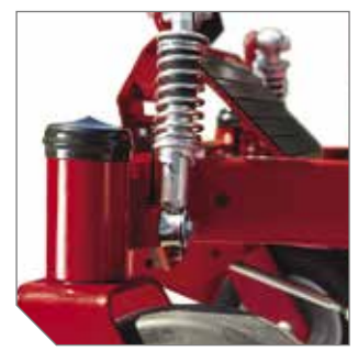
The Suspension Comfort System<sup>™</sup> (SCS<sup>™</sup>) complete with front and rear springs allows the operator to feel 25% less impact° while operating resulting in enhanced comfort versus nonsuspension zero-turn mowers.‡