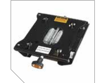
Suspension Seat Insert Add this to the premium seat for increased comfort.