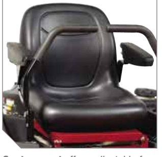
Contour seat offers adjustable fore and aft positioning and arm rests for operator comfort.