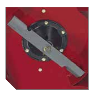
Marbain® Steel Blades

Standard equipment on all \mathsf{iCD}^\mathsf{TM} Cutting System decks.