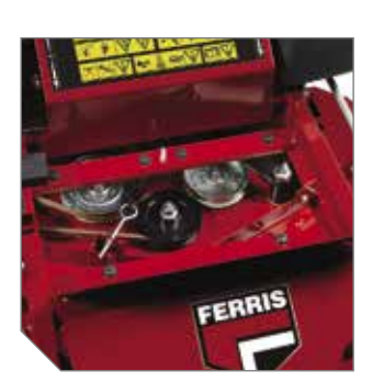
Quick removal of the floor pan provides convenient access to the top of the deck for easy cleaning and service.