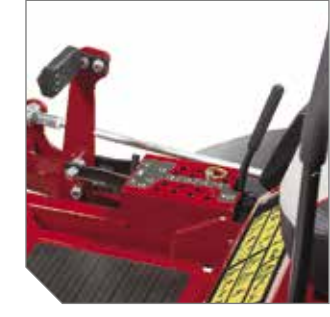
Foot-operated deck lift, with adjustable pedal, can change cut height in 1/4" increments from 1.5"- 5".