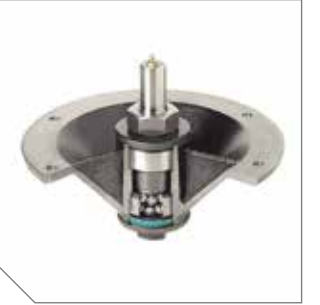
Hercules™ II Spindles industrial 10" dia. cast-iron spindle assembly with 1 3/16" dia. shaft and greaseable double row angular contact ball bearings, which can be greased through the convenient top access grease fitting.