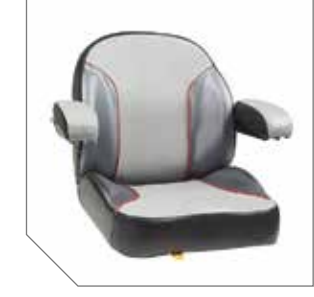
Premium Seat High quality adjustable seat features red trim with adjustable armrests for added comfort. Select models.