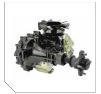
Commercial Hydro-Gear® ZT-3400® Transaxles are designed for high performance and are fully serviceable.