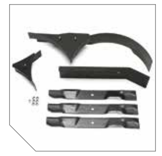
Mulch Kit Select kits include dedicated mulching blades, baffles, hardware and