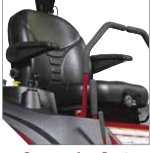
Suspension Seat Suspension seat for optimal comfort. Select models.