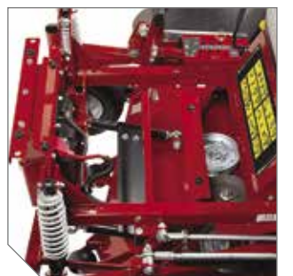
Quick removal of the floor pan provides convenient access to the top of the deck for easy cleaning and service.

• Mulch kit, trailer hitch kit, ROPS mounted LED light kit, flat-free