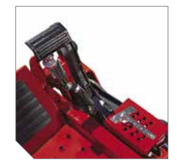
Foot-operated deck lift, with adjustable pedal, can change cut height in 1/4" increments from 1.5"- 4.5".

• Adjustable solid steel padded control arms