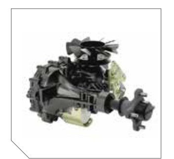
Commercial Hydro-Gear® ZT-3400® Transaxles are designed for high performance and are fully serviceable.