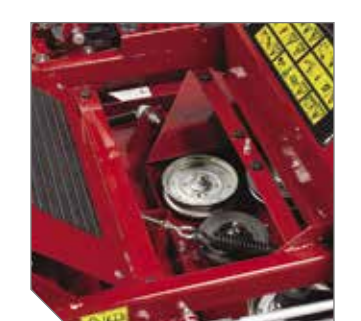
Quick removal of the floor pan provides convenient access to the top of the deck for easy cleaning and service.