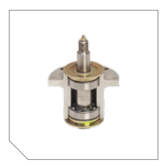
Aluminium Spindles feature 1" shaft with greaseable 2.5" x 1" dual ball bearings with top access grease fittings and pressure relief valve.