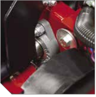
Smooth, precision controls last longer as a result of pillow block bearings on control mounts.