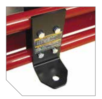
Trailer Hitch Kit Will accept a 1/2" shank ball and comes complete with hardware.