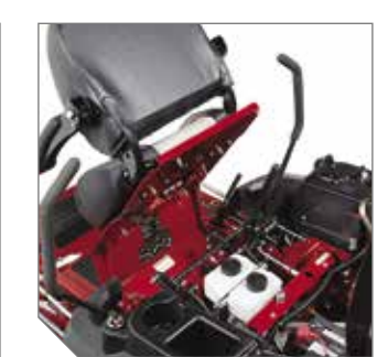
Flip-up seat provides easy access to serviceable components. Belt and blade part numbers are referenced under seat.