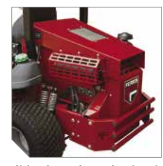
Noise-dampening engine shroud absorbs and reduces noise for improved operator and bystander comfort.