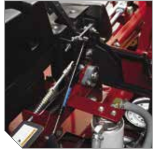
Exclusive steering system delivers exceptionally smooth performance.