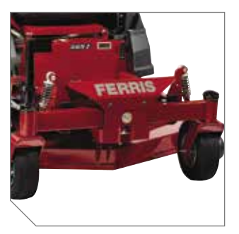
A pivoting front axle in conjunction with the SCS™ provides for a smooth ride.