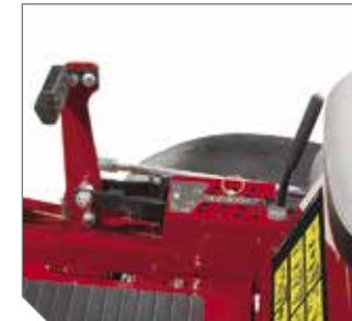
Foot-operated deck lift, with adjustable pedal, can change cut height in 1/4" increments from 1.5"- 5".