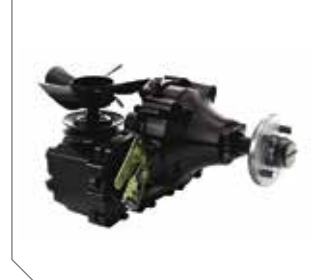
Dual, commercial Hydro-Gear® ZT-5400 Powertrain® Transaxles deliver unmatched power and durability.