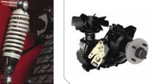
Fully serviceable commercial Hydro-Gear® ZT-4400™ Transaxles deliver power & durability.