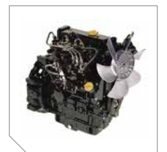
Efficient Yanmar™ 3-cylinder diesel engine.