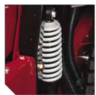
Exclusive suspension system consists of adjustable rear coil-over-shocks (shown) and front independent adjustable coil-over-shocks.