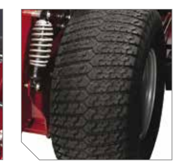
Large 26" drive tyres allow for greater traction, smoother ride and improved curb climbing performance.