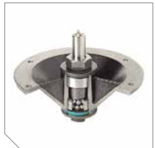
Hercules ™ II Spindles industrial 10" dia. cast-iron spindle assembly with 1 <sup>3</sup>/<sub>16</sub>" dia. shaft and greaseable double row angular contact ball bearings, which can be greased through the convenient top access grease fitting.