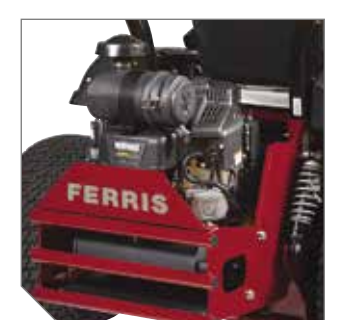
Vanguard<sup>™</sup> 810 EFI Engines deliver more grass cutting capability than the leading EFI engine. Up to 25% fuel savings!†