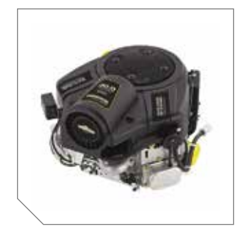
Briggs & Stratton® Commercial Series Engines are built with the ultimate in dust and particle filtration, an advanced debris management system and beefed-up cylinder block structure.