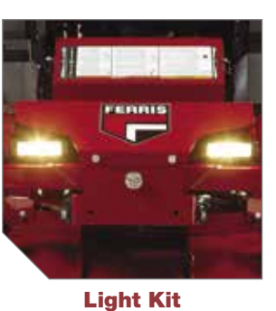
Select models are pre-wired for simple installation.