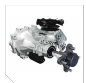
The ZT-2800 ® is Hydro-Gear®'s premium transaxle with charge pumps providing tough and smooth operation for larger properties.