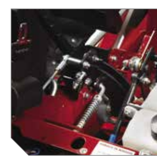
Exclusive steering system delivers exceptionally smooth performance.