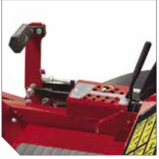
Foot-operated deck lift, with adjustable pedal, can change cut height in 1/4" increments from 1.5"- 5".