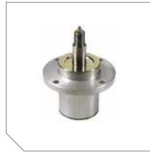
Aluminium Spindles feature 1" shaft with greaseable 2.5" x 1" dual ball bearings with top access grease fittings and pressure relief valve.