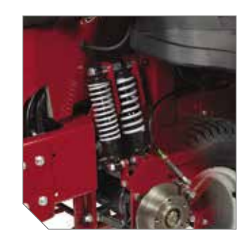
Exclusive suspension system consists of dual rear coil-overshocks with dual suspension arms (shown) and front independent adjustable coil-over-shocks.