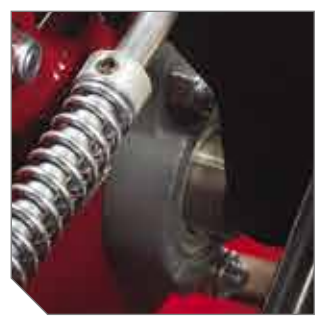
Smooth, precision controls last longer as a result of pillow block bearings on control mounts.