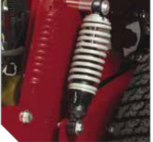
Exclusive suspension system consists of adjustable rear coil-over-shocks (shown) and front independent adjustable coil-over-shocks.