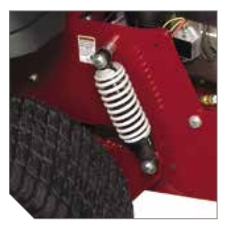
Exclusive suspension system consists of rear coil-over-shocks (shown) and pivoting front axle with coil-over-shocks.