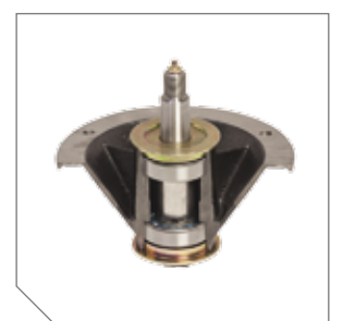
Cast-Iron Spindles longer usable life, 1" shaft with top access grease fitting for greaseable dual ball bearings, six-bolt 8" flange design adds strength and greater dispersal of energy to deck assembly. (61" models)