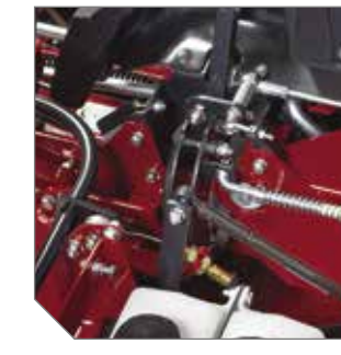
Exclusive steering system delivers exceptionally smooth performance.