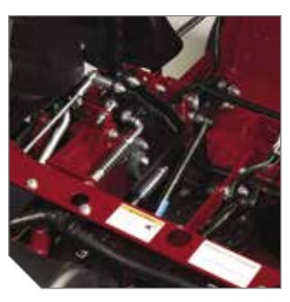
Exclusive steering system delivers exceptionally smooth performance.