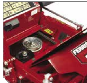
Quick removal of the floor pan provides convenient access to the top of the deck for easy cleaning and service.