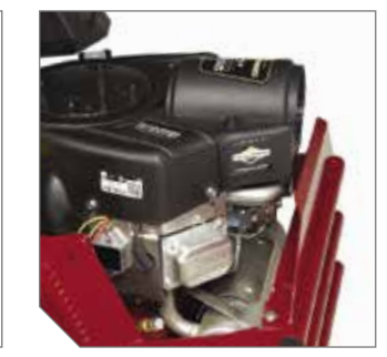
Heavy-duty bumper protects the engine while also allowing for easy service access.