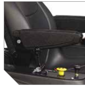
Armrests Add these foldable armrests for increased riding comfort on IS® 600Z.