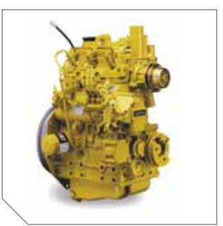
Caterpillar® 1500cc (model 3013C) diesel engine with 55 ft/ lbs of torque* at 2800 rpm delivers more torque at a lower rpm for increased power when needed.

Power levels rated by engine manufacturer