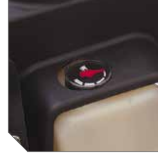
Easily accessible fuel gauge.