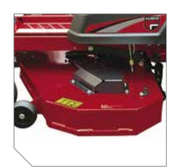
The rugged welded mower deck is made of 10- or 12-gauge steel with reinforced top, side skirts, corners and a steel front edge ensuring excellent quality of cut and durability.

°Results of suspension depend on grass/yard conditions. ^{\ddagger}42^{\shortparallel} model features front springs only.