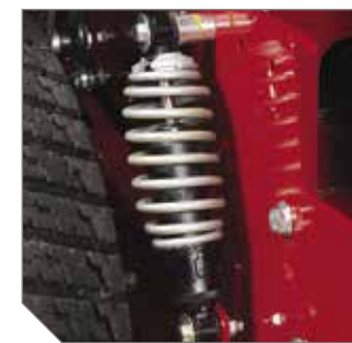
Exclusive suspension system consists of adjustable rear coil-over-shocks (shown) and front independent adjustable coil-over-shocks.