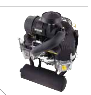
For the most challenging applications, the Vanguard <sup>™</sup> BIG BLOCK™EFI Engine options have been expertly engineered to deliver the dependability to get more done in less time.