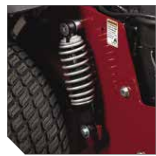
Exclusive suspension system consists of rear coil-over-shocks (shown) and pivoting front axle with shocks.